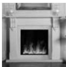
Riva2 Electric 70 with Victorian Corbel Mantel in Limestone