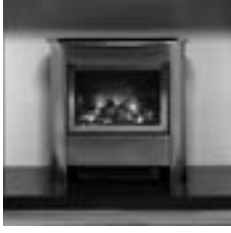
Steel Manhattan Electric