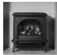
Electric Huntingdon 30 with Tracery Door