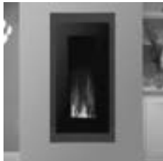
Studio 22 Electric - E-Motiv in Walnut with Black Glass Front