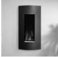
Studio 22 Electric - Verve