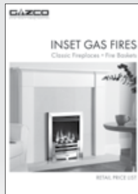
Inset Gas Fires & Fire Baskets