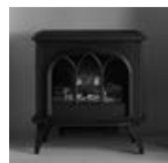
Electric Huntingdon 40 with Tracery Door