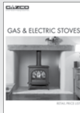
Gas & Electric Stoves