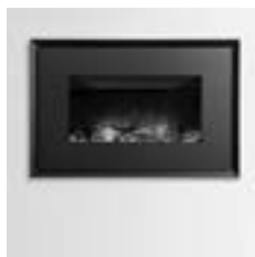
Riva2 670 Evoke Steel with Metallic Red Front

List Price £ excl. VAT Suggested Retail Price £ incl. VAT