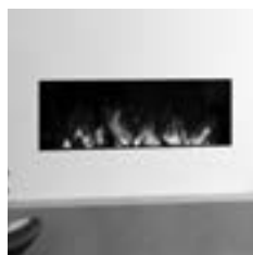
Studio Electric Inset 105