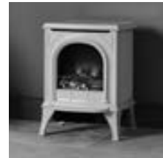
Electric Huntingdon 20 with Clear Door