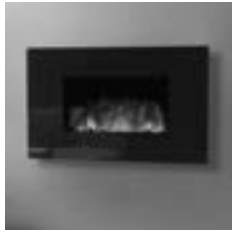
Studio 1 Electric - Glass