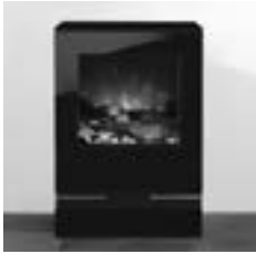
Vision Electric Small