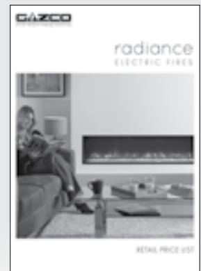
Radiance Electric Fires